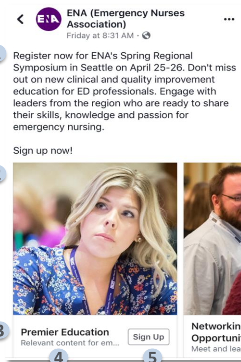
Image Ad Specs